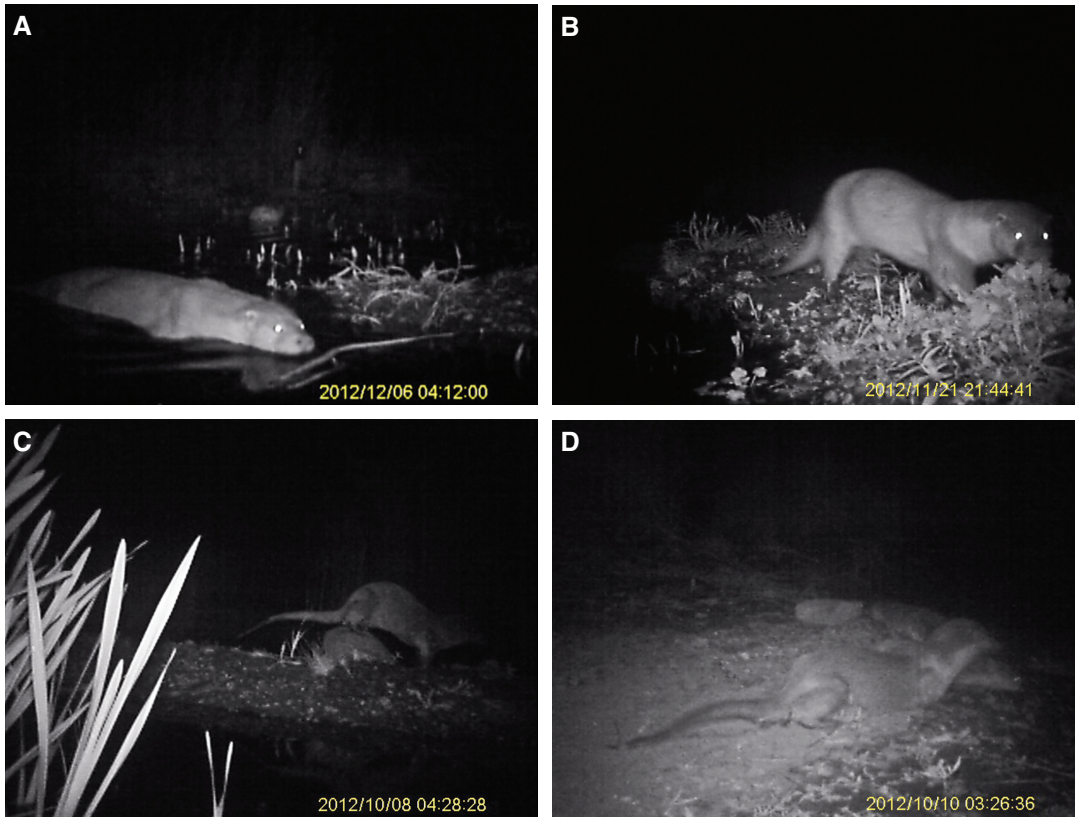
Figure 2 Still images extracted from videos recorded by infrared cameras (LTL Acorn 5210A) using low-glow flash technology. (A) Adult otter swimming. (B) Adult otter walking. (C) Adult otter spraint marking. (D) A likely adult female with three cubs.

Europe to study and protect Eurasian otters. In Greece, however, the species has gone largely unnoticed by the scientific and conservation community; indicative of this situation is the fact that only few studies can be found in the peer-reviewed literature, most of which being more than a decade old (e.g., Macdonald and Mason 1982, 1985, Delaki et al. 1988, Gaethlich 1988, Gémillet 1993, Gourvelou et al. 2000, Ruiz-Olmo 2006).